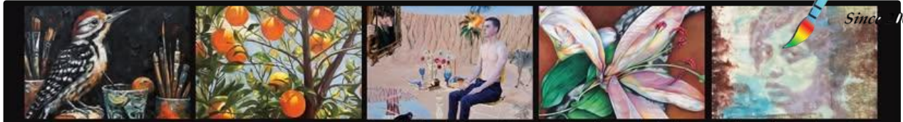
Artwork shown is a sampling of award winning work from the previous show.